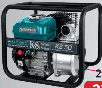
Motor pump for clean water KS 50