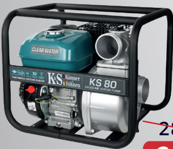
Motor pump for clean water KS 80