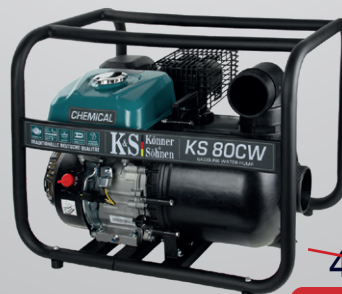
Chemical motor pump KS 80CW