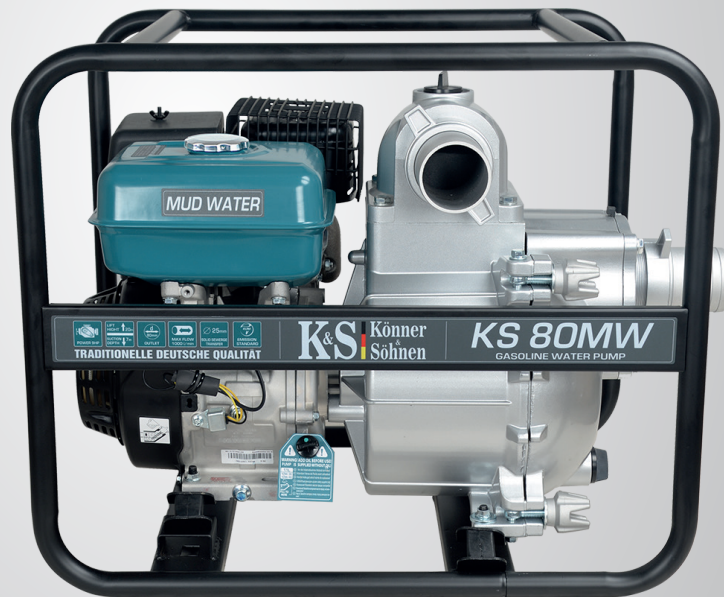
Motor pump for mud water KS 80MW