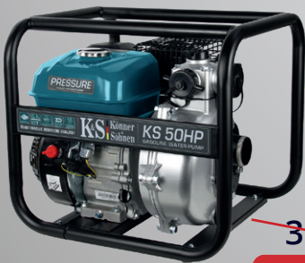
High-pressure water pump KS 50HP